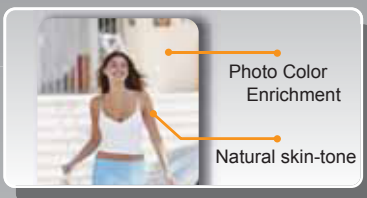
Retransfer Color Performance at Direct Print to Card Technology